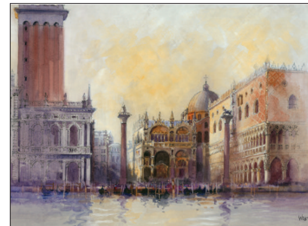
Evening Light, Piazza di San Marco