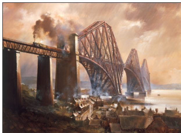
Over the Forth