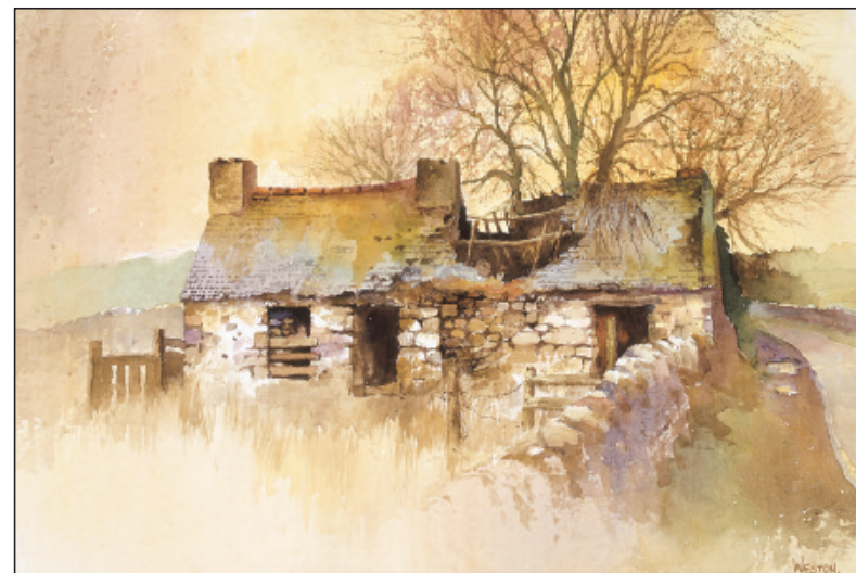
Old Farm on Anglesey